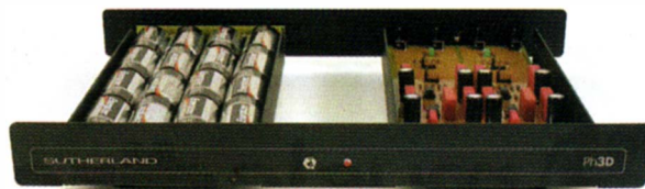
Sutherland Ph3D powered by 16 Walgreen's "D" alkaline batteries. Sound was "medicinal." Energizers sounded "faster." NOT!!!!

Like the Simaudio Moon LP 5.3, the Ph3D uses gold-plated, high-pressure, large-contact jumpers for setting gain (40, 45, 50, 55, or 60dB) and loading (100, 200, 1k, 10k, or 47k ohms).